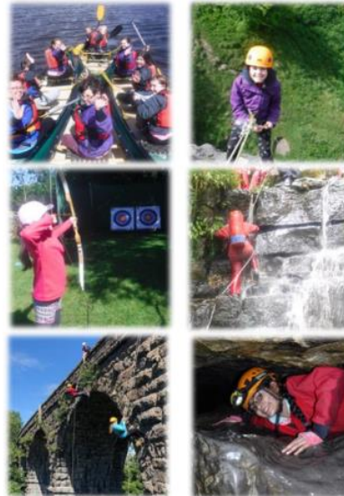
Healthy Exercise Together - Team Working Building Resilience - Motivating